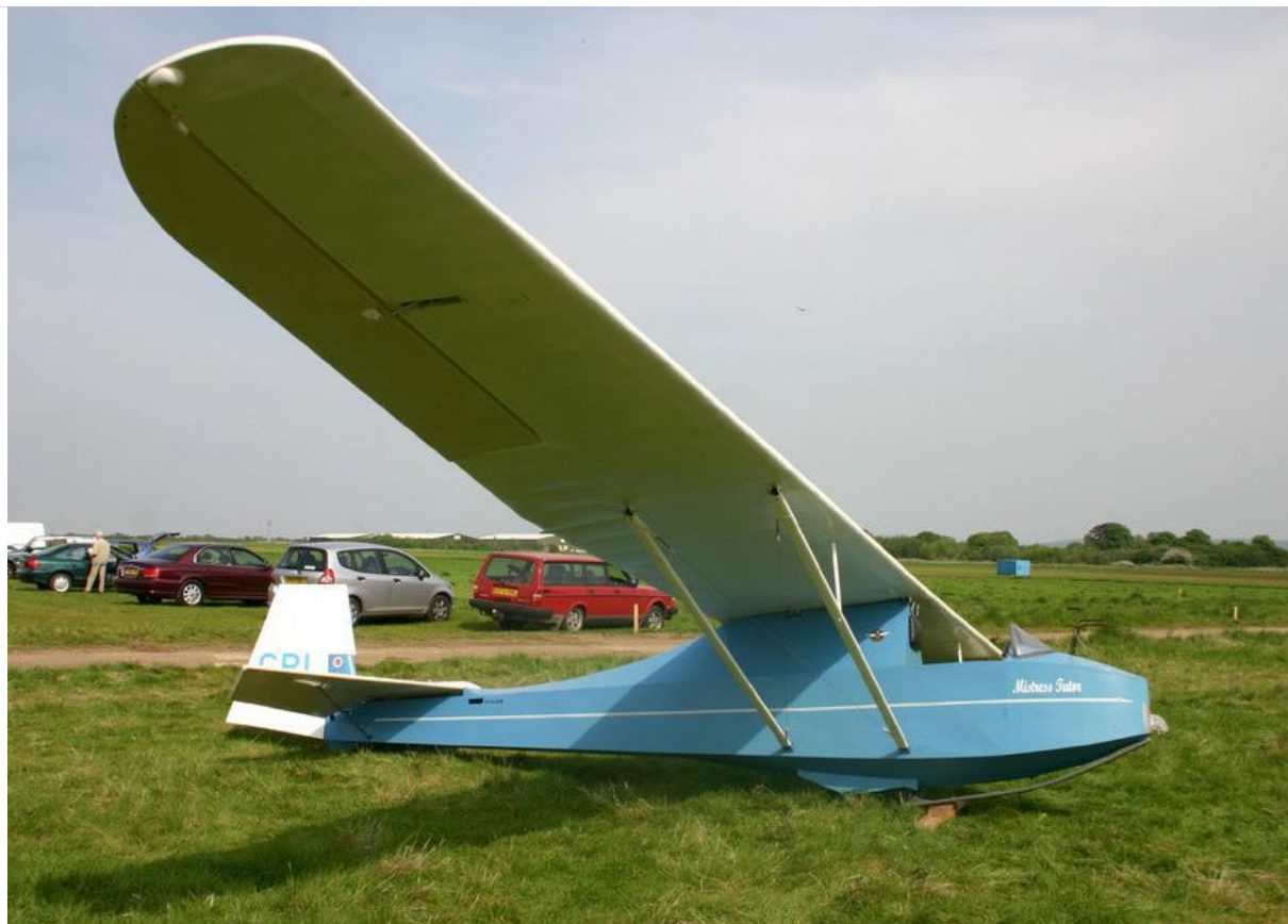
At first sight photo taken at Lasham outside the GHC – but I don't think it is!