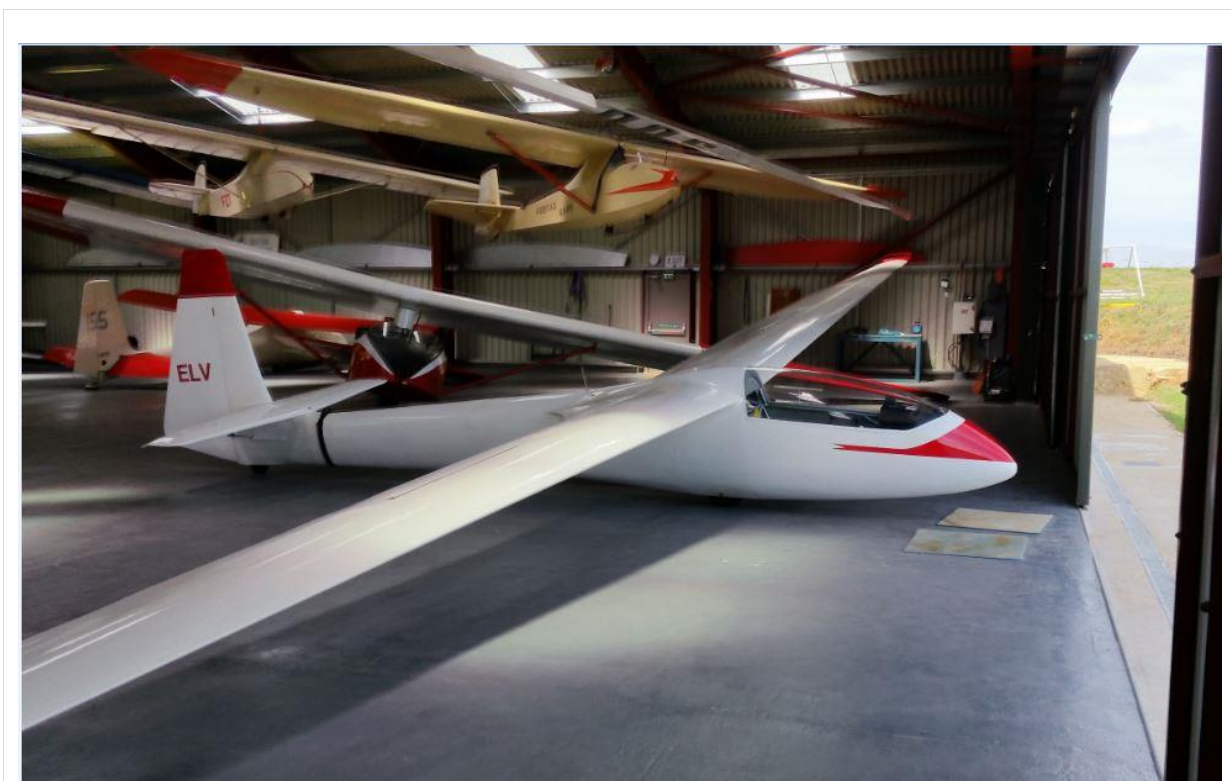
In 2 nd GHC hangar at Lasham