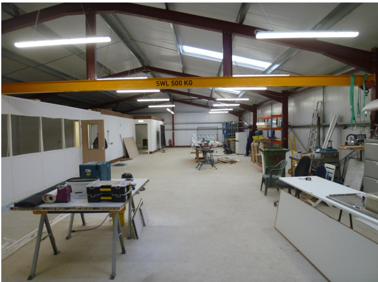
(The internal structure coming together, 27 th September – Julian Ben-David)